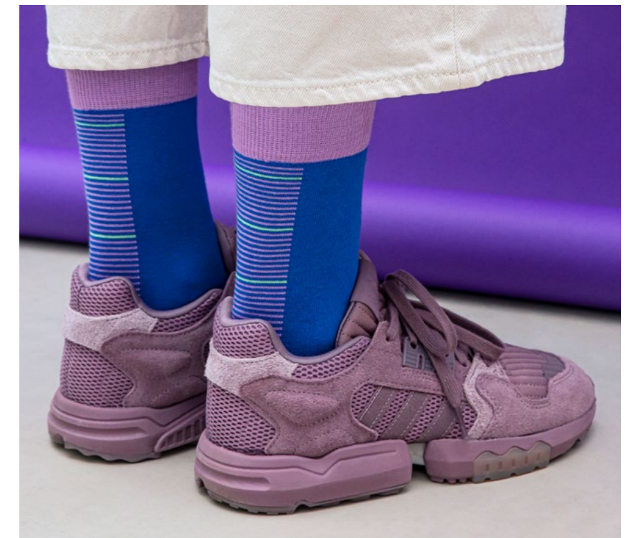
Raw Color | Temperature Textiles Collection, Sea Level Socks | Knitted socks, 75% cotton, 23% polyamide, 2% lycra