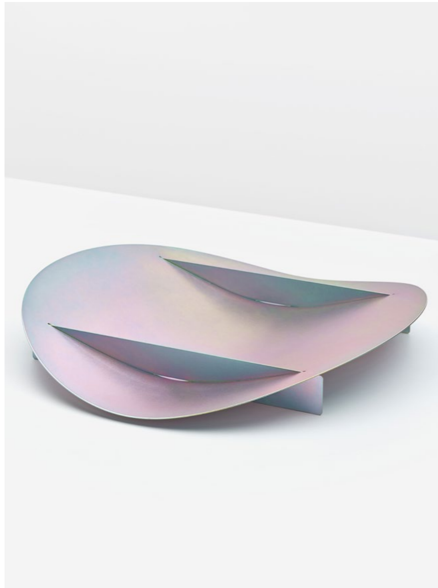
Paul Coenen | Tension Bowl | Zinc plated steel | Photo about.today