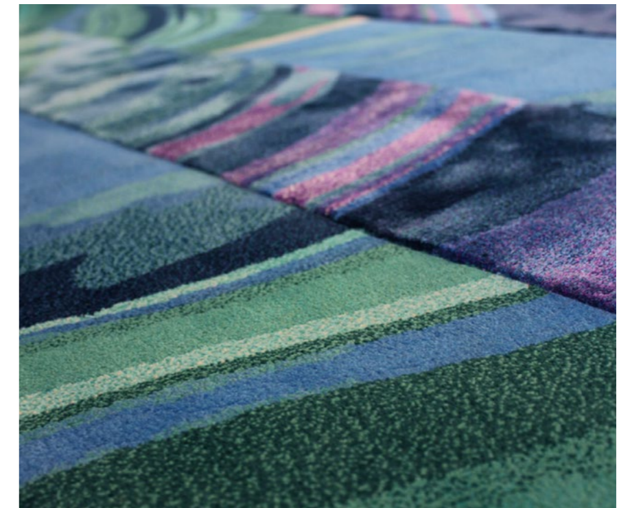
TSAR Carpets | Forma Collection, Yin Design | Hand-tufted rug, fully customisable

From the cooler side of the Kingdoms palette, these analogous hues have a digital quality that offers a contrast to the core handmade aesthetic of the story. Acting as a neutral, yellow-green Celadon shifts into blue-cast Parrot Green and through blue Cerulean into purple Ultra Lilac. Gradient use evokes anodised finishes while defined edges are pleasingly harmonious.