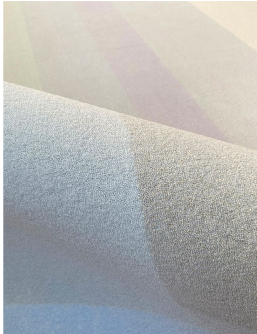
Studio RENS x Moooi Carpets | Blended Rugs, Morning White | Polyamide, soft yarn, wool

This trio of heavily tinted hues capture the quality of light on reflective surfaces. Clean Menthol is paired with the green-yellow Aloe Water, which in turn complements the purple undertone of grey Rainwater. This subtle iridescence plays naturally on hard surfaces; glass, powder coated and illuminated, while we note the success of innovative use in woven textiles.