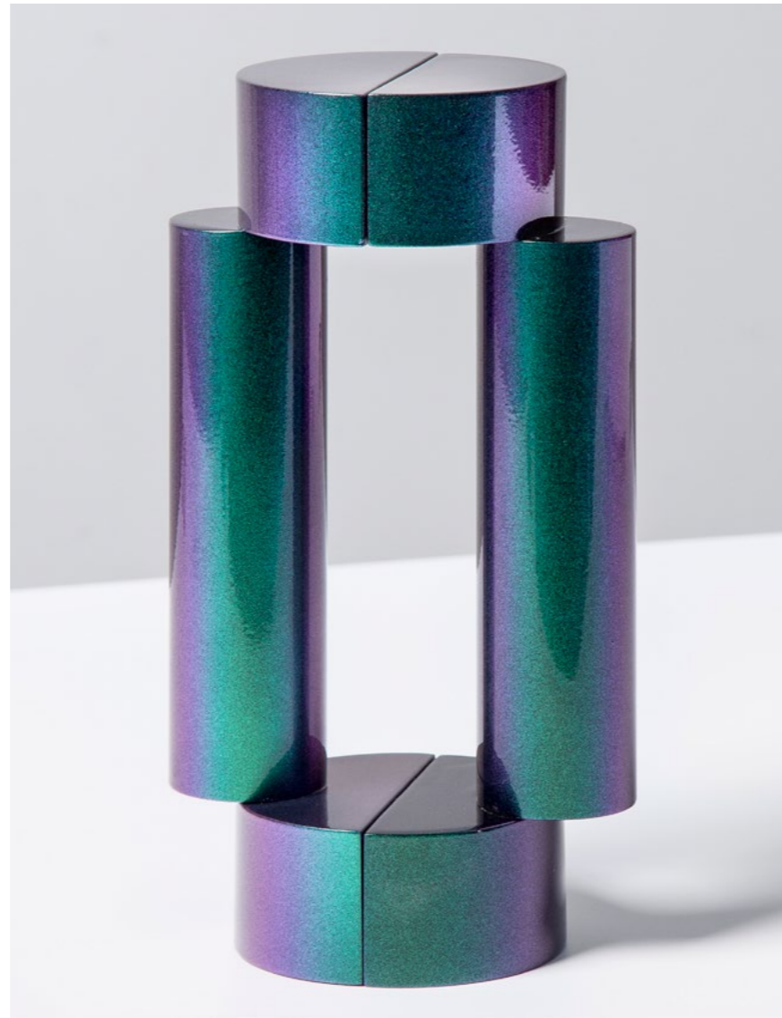
Ulysse Martel x Candice Joyce Blanc | Olympia Dumbbells Collection | Steel and iridescent lacquer

From the cooler side of the Kingdoms palette, these analogous hues have a digital quality that offers a contrast to the core handmade aesthetic of the story. Acting as a neutral, yellow-green Celadon shifts into blue-cast Parrot Green and through blue Cerulean into purple Ultra Lilac. Gradient use evokes anodised finishes while defined edges are pleasingly harmonious.